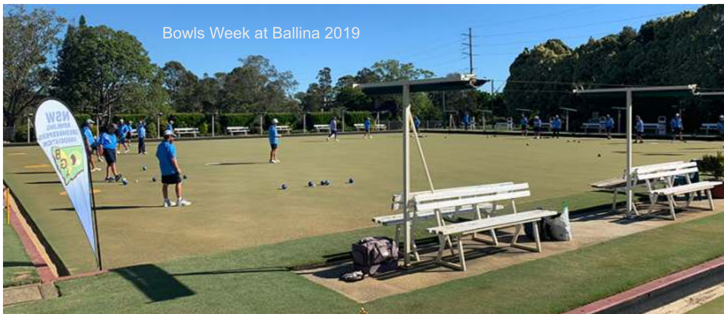
Bowls Week at Ballina 2019

Contact the Editor to book your next advertisement in The Bowling Greenkeeper .