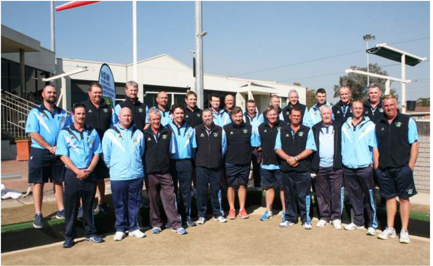
Pictured: The NSWBGA Greenkeepers ready for play at Engadine Bowling Club in July.