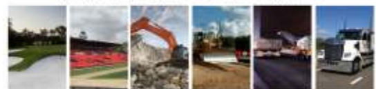
GOLF OVALS QUARRY CIVIL NIGHTS HAULAGE