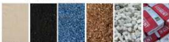
SANDS SOILS AGGREGATE MULCHES PEBBLES CEMENT