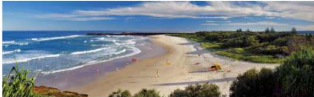
Ballina RSL Club

Ballina RSL Club are proud hosts for the next two years of the NSWBGA championships and we welcome everyone to come and enjoy our beautiful part of the Northern Rivers.