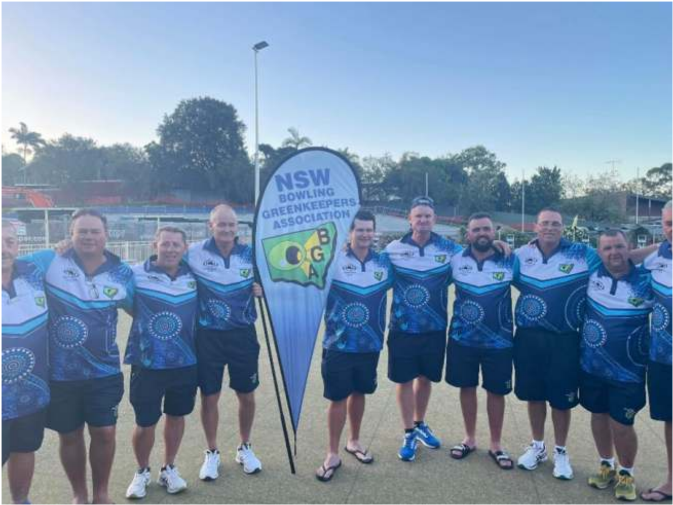
Above: Sea of blue in the white wash in the Australian Championships.

Day 5 and with some sore heads after celebrating the NSW clean sweep, we headed to Mudgeeraba BC for our trade show day and last of our presentations. There was some impressive new machinery and products on display from BA Group, Tru-Turf, MTD, ATM, Toro, Air2turf, Rain Bird, Lawford Engineering and Turf Engineering/Golf & Bowls.