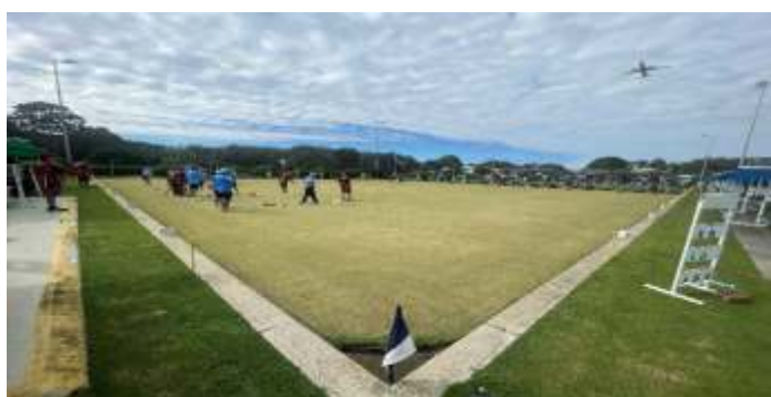
Image: Plane flies over first test at Tugun BC .

Day 2 saw us head to the windy hill Club Musgrave. The day kicked off with our first presentations of the week from Syngenta, Living Turf and Campbell.