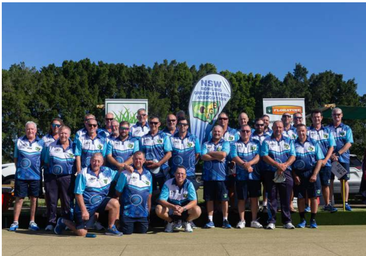
Pictured: NSW Greenkeepers at Gold Coast 2023.

Gold Coast 2023 was in full swing with over 100 greenkeepers from NSW, QLD, SA and VIC all coming together for educational seminars, machinery displays, sports tours and competitive but fun bowls.