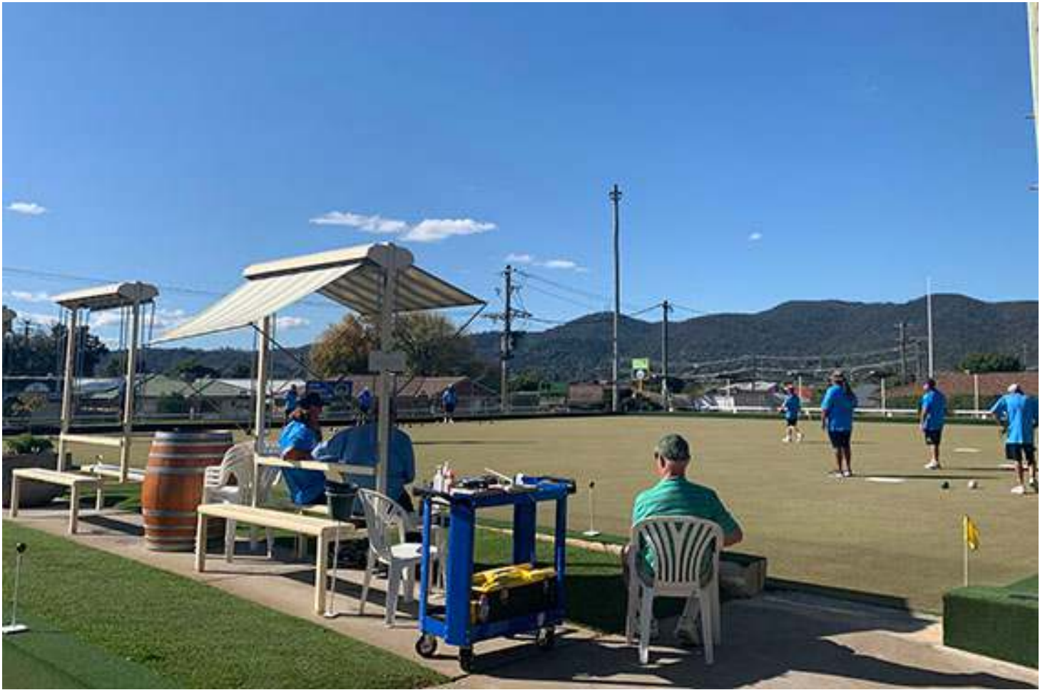
Pictured: South Tamworth Bowling Club in the New England region was the host for the NSW BGA State Championship Week 2022.