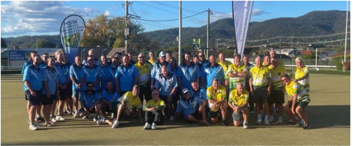
Pictured: The NSWBGA Greenies vs the hosts, South Tamworth Bowling Club played the President's Challenge with the Greenies coming out on top.